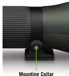
Mounting Collar Thumb Screw

Rotate the Diamondback® scope body for a variety of viewing positions — shown here with the angled eyepiece.