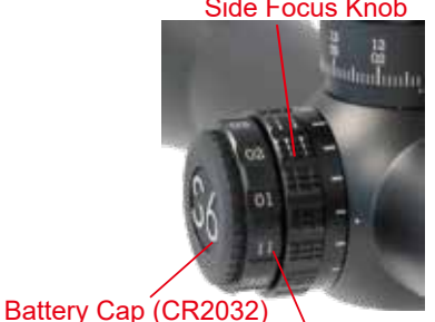
Side Focus Knob

Rotate the illumination switch to the required setting for the lighting conditions.