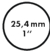
Main tube 25.4 mm