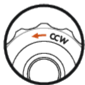
Adjustment direction CCW